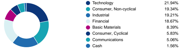
31 January 2021